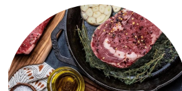
FRESH AND FROZEN MEATS