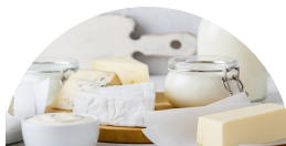
DAIRY AND PERISHABLES