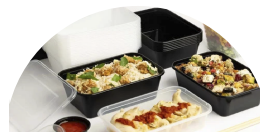
PLASTICS AND CONTAINERS